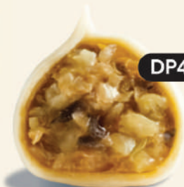
DP4 Long Cabbage & Mushroom Pan-Fried Dumplings 白菜香菇煎饺子 (vegetarian)