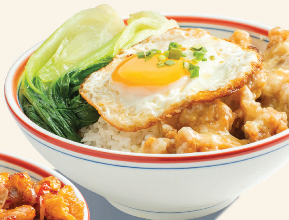
R3 GARLIC BUTTER BOWL 大蒜奶油丼饭