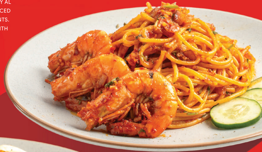
WT10 ★ SAMBAL PRAWN PASTA 叁巴虾意面

OUR PASTA DISHES ARE CRAFTED WITH PERFECTLY AL DENTE PASTA, TOSSED IN RICH AND WELL-BALANCED SAUCES, AND FINISHED WITH QUALITY INGREDIENTS. EACH PLATE DELIVERS COMFORTING FLAVORS WITH A REFINED WESTERN TOUCH, IDEAL FOR A SATISFYING AND INDULGENT MEAL.