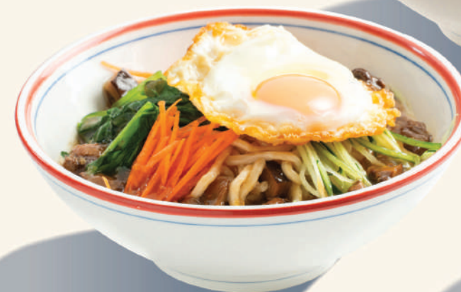
N8 MINCED MEAT MUSHROOM NOODLES 香菇肉燥拌面