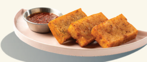
SN12 FRIED YAM CAKE(3PCS) 炸芋头糕 (3个)