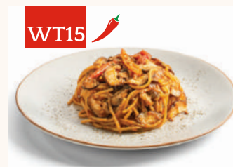
WT15 SPICY MUSHROOM TOMATO PESTO PASTA 辣味蘑菇番茄青酱意面