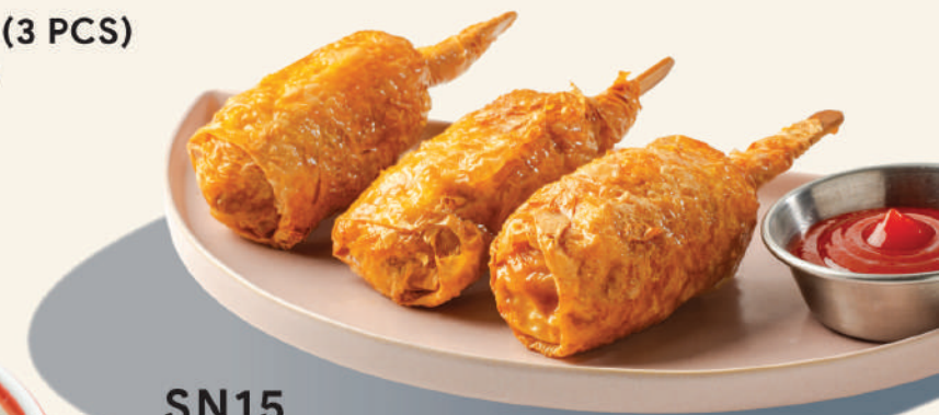
SN15 VEGETARIAN DRUMSTICK (3 PCS) 素鸡腿 (3个)