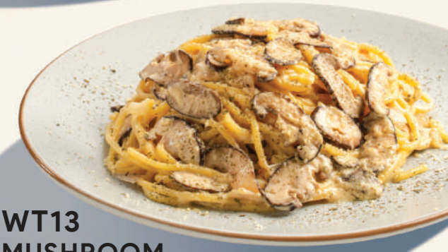
WT13 MUSHROOM CARBONARA PASTA 蘑菇奶油意面