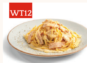
WT12 CHICKEN CARBONARA PASTA 鸡肉奶油意面