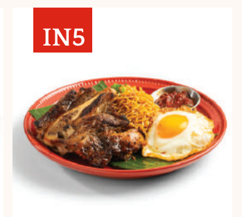
IN5 INDOMIE GRILLED LAMB CHOP