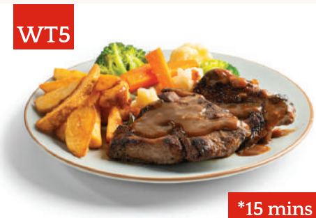
WT5 GRILLED LAMB CHOP 香煎羊排