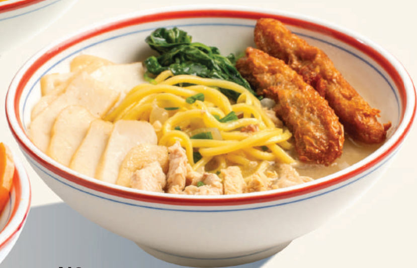
N3 FISH CAKE & CHICKEN SLICE SOUP NOODLE 鱼饼与鸡肉清汤面