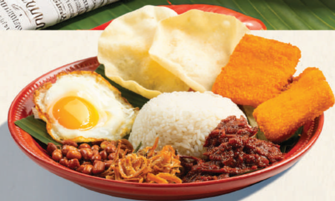
NL2 NASI LEMAK FISH FILLET 炸鱼柳椰浆饭