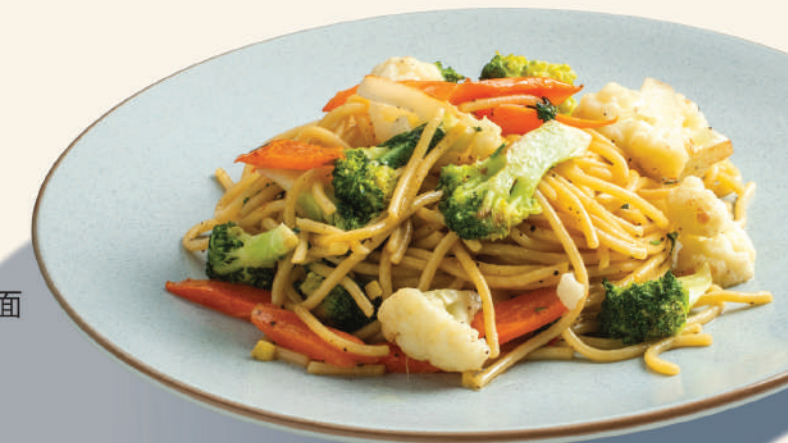
V8 MIX VEGE PASTA 混合蔬菜意面