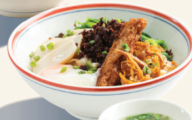
N9 ONSEN EGG CHILI MEE 温泉蛋辣椒面 A) Chicken B) Beef

A Mee 面 B Bee Hoon 米粉 C Kuey Teow 粿条 D Rice 白饭 E Instant Noodle 快熟面 F Pan Mee 板面