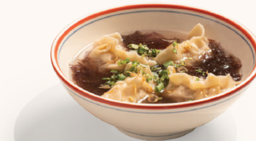
DUMPLING SOUP 饺子汤