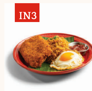
IN3 INDOMIE CRISPY FISH