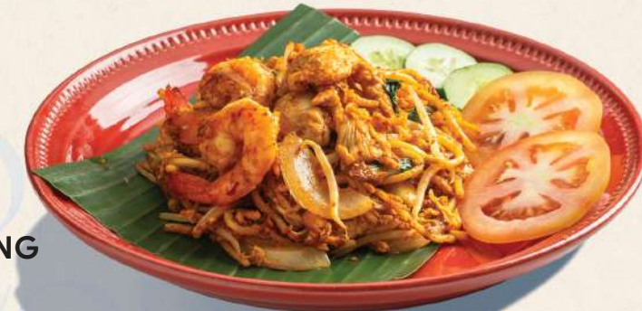
W8 MEE GORENG MAMAK 印度式炒面