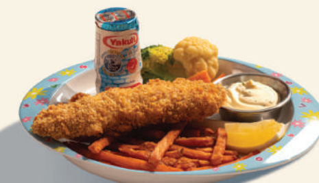
KID4 FISH & CHIP WITH YALKULT 儿童炸鱼薯条