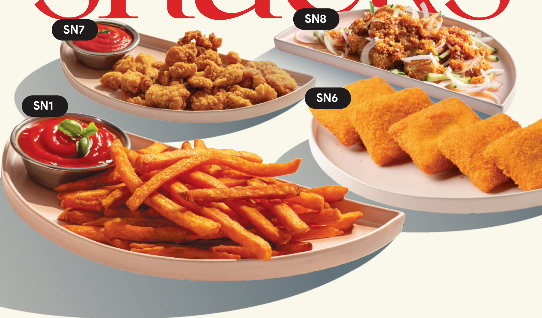
SN1 SWEET POTATO FRIES 炸地瓜条