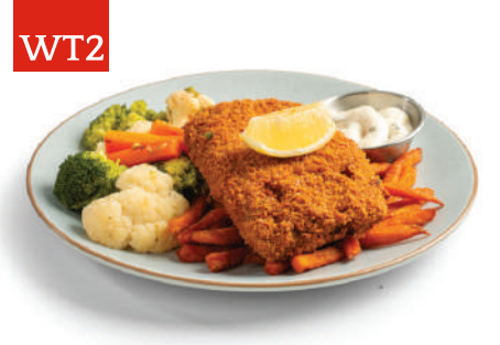
WT2 SIGNATURE FISH & CHIP 炸鱼薯条