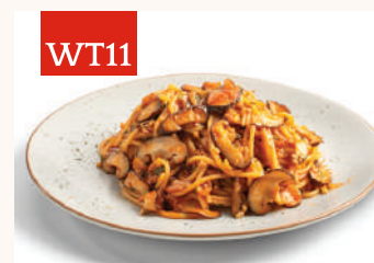
WT11 MUSHROOM TOMATO PASTA 番茄蘑菇意面