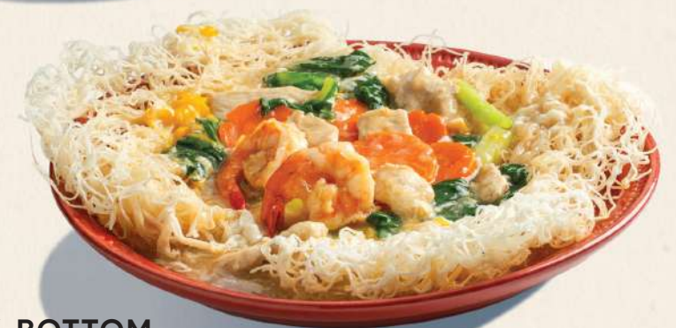
W11 CRISPY-BOTTOM RICE NOODLES 香底米粉