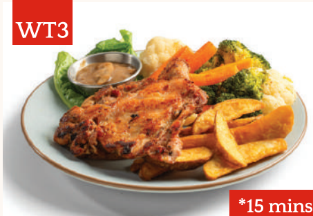
WT3 GRILLED CHICKEN CHOP 香煎鸡排