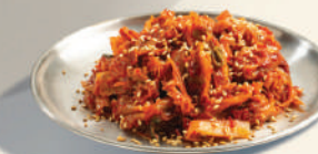
SIDE 1 Spicy Pickled Cabbage 东北辣白菜