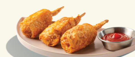
SN15 VEGETARIAN DRUMSTCK(3PCS) 素鸡腿 (3个)