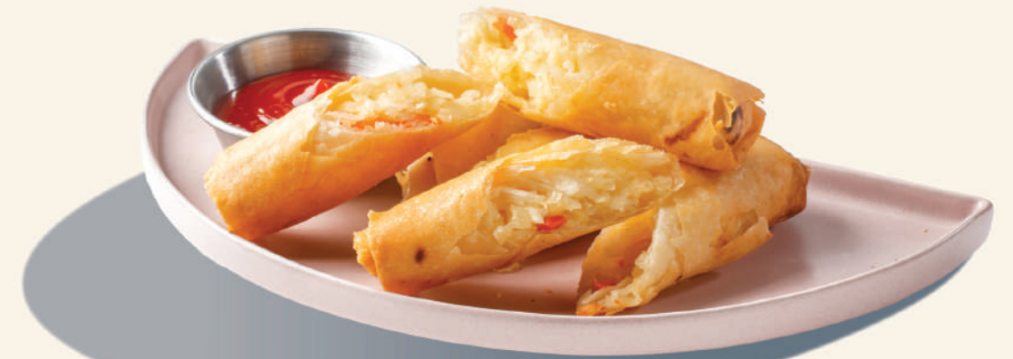
SN14 VEGETABLE SPRING ROLL (3 PCS) 蔬菜春卷 (3个)