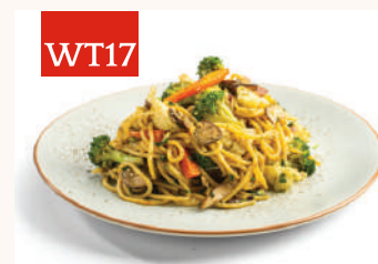
WT17 MIX VEGE PESTO PASTA 混合蔬菜青酱意面