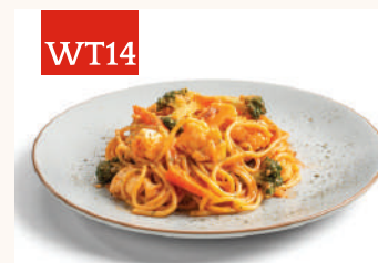
WT14 MIX VEGE TOMATO CREAMY PASTA 混合蔬菜番茄奶油意面