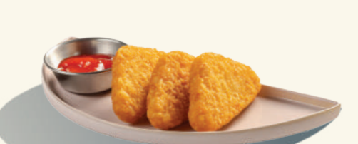
SN16 GOLDEN HASH BROWN(3PCS) 黄金薯饼 (3个)