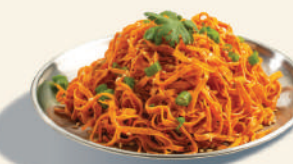
SIDE 2 Cold Tossed Tofu Skin 凉拌豆皮