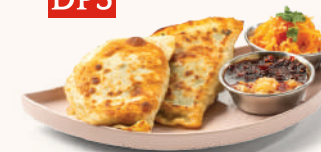
PAN-FRIED CHIVES POCKETS 煎韭菜鸡蛋盒子