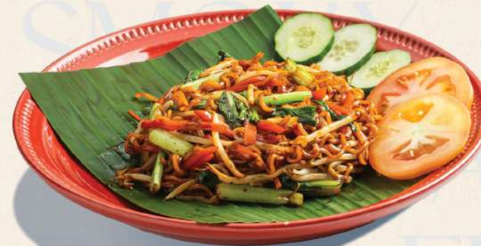
W7 SIGNATURE FRIED MEE (INSTANT NOODLE) 招牌炒面