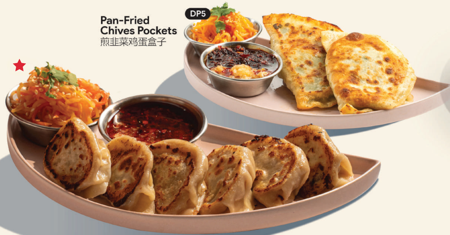
Pan-Fried Chives Pockets 煎韭菜鸡蛋盒子