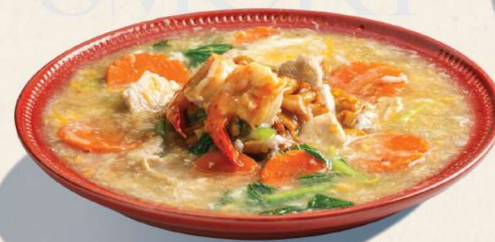
W10 CANTONESE FRIED KUEY TEOW 广式滑蛋河粉