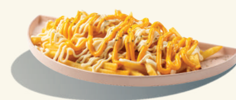
SN3 CHEESY FRENCH FRIES 芝士炸薯条