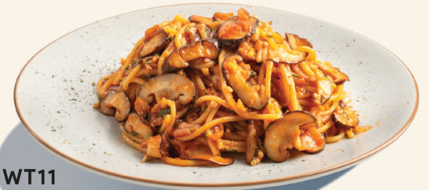
WT11 MUSHROOM TOMATO PASTA 番茄蘑菇意面