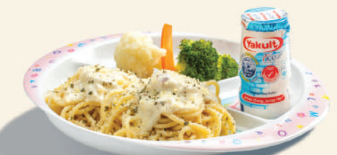
KID3 CARBONARA PASTA WITH YALKULT 儿童奶油意面