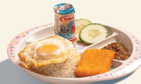
KID1 NASI LEMAK WITH YALKULT (NON-SPICY SAMBAL) 儿童椰浆饭

A) Chicken Frankfurter 鸡肉香肠 B) Fish Fillet 炸鱼柳