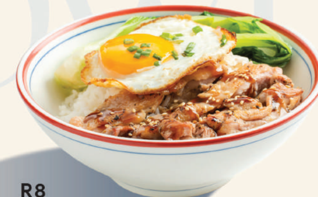
R8 TERIYAKI CHICKEN RICE BOWL 鸡肉照烧酱丼饭