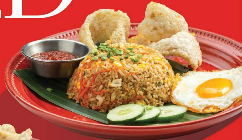
W1 RASA EGG FRIED RICE 蛋炒饭

HIGH-HEAT STIR-FRIED IN A BLAZING WOK TO LOCK IN BOLD AROMAS AND SMOKY "WOK HEI", DELIVERING VIBRANT FLAVORS WITH A SATISFYING CHAR AND IRRESISTIBLE FRAGRANCE.