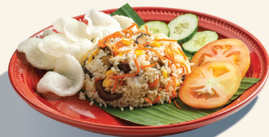
V1 VEGE FRIED RICE 素炒饭

VIBRANT INGREDIENTS WITH THOUGHTFUL SEASONING AND BALANCED FLAVORS. EACH PLATE IS CAREFULLY COMPOSED TO HIGHLIGHT NATURAL TEXTURES, COLORS, AND AROMAS, CREATING MEALS THAT ARE WHOLESOME, SATISFYING, AND FULL OF LIFE.