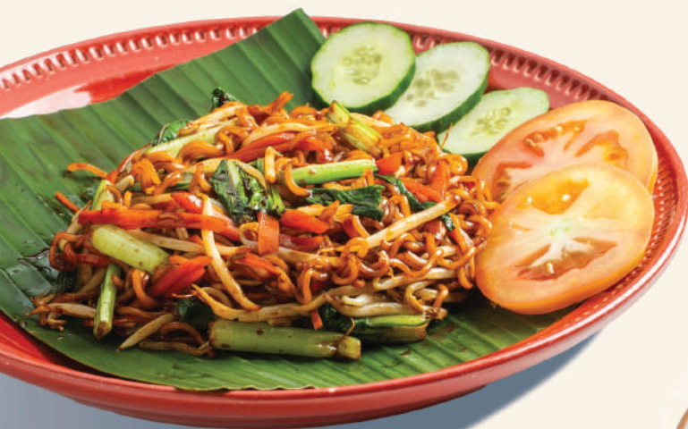
V2 VEGE FRIED NOODLE (INSTANT NOODLE) 素炒面