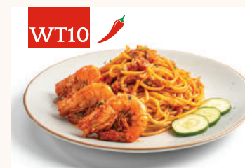
WT10 SAMBAL PRAWN PASTA 叁巴虾意面