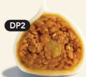
DP2 Beef & Long Shallot Pan-Fried Dumpling 牛肉北葱煎饺子