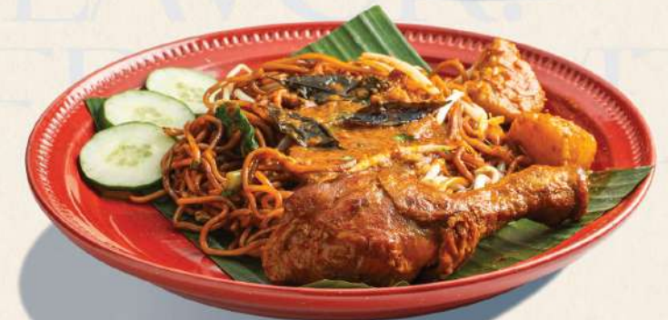
W9 DRY CURRY CHICKEN NOODLES 干捞咖喱鸡面