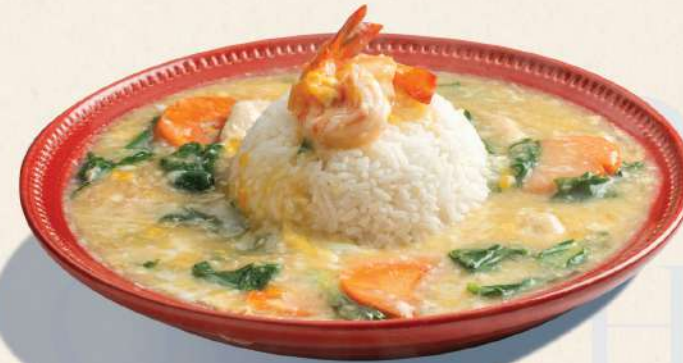
W5 BRAISED RICE 烩饭

IMAGES SHOWN ARE FOR ILLUSTRATION PURPOSE ONLY