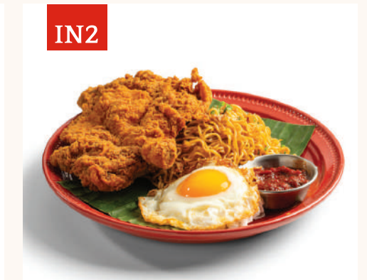
IN2 INDOMIE CRISPY CHICKEN CHOP