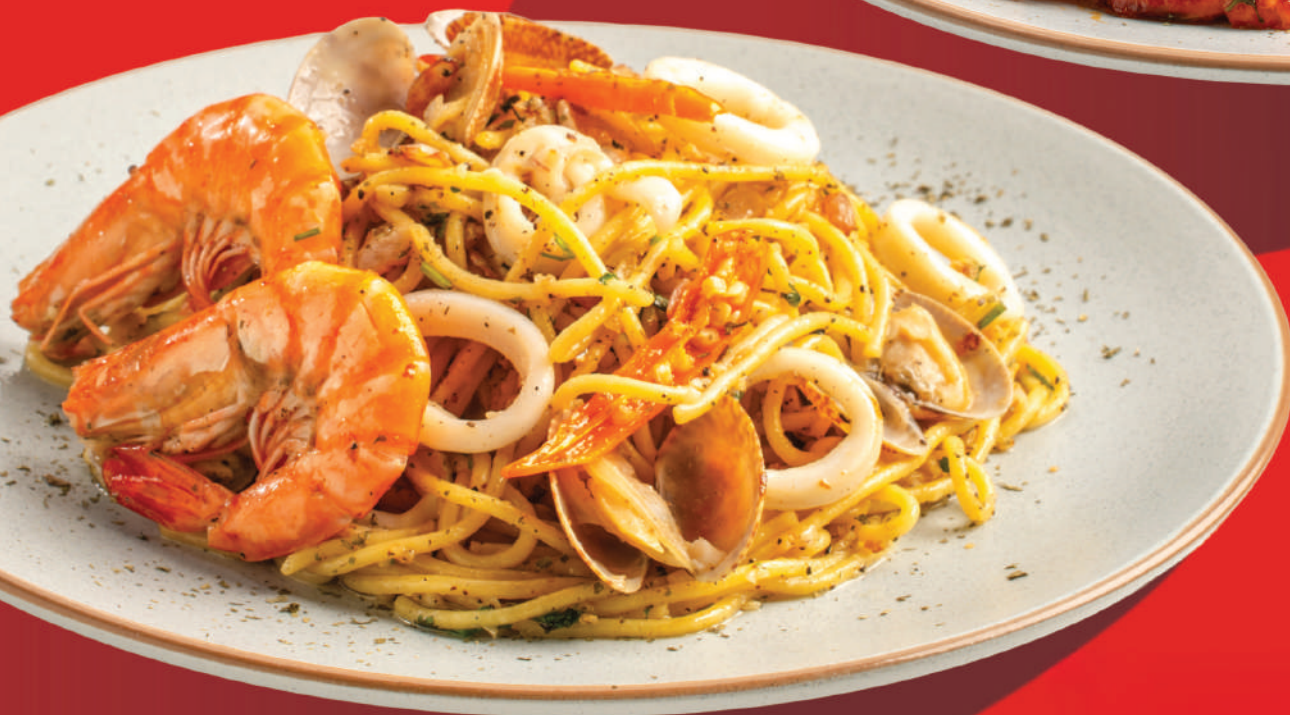
WT9 ★ SEAFOOD AGLIO-OLIO PASTA 蒜油海鲜意面