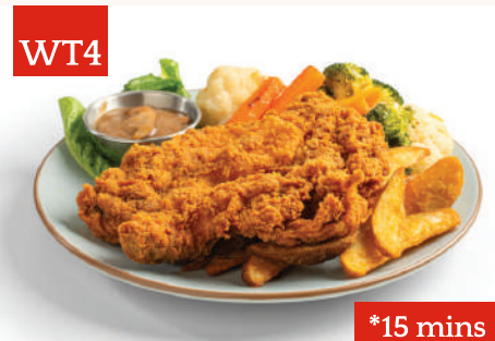
WT4 CRISPY CHICKEN CHOP 香脆炸鸡排