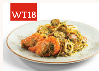
WT18 SEAFOOD PESTO PASTA 青酱海鲜意面