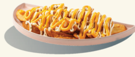
SN5 CHEESY POTATO WEDGES 芝士炸薯块