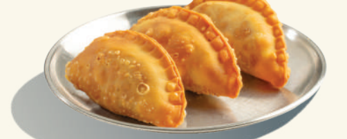
SN10 POTATO CURRY PUFF(3PCS) 咖喱马铃薯角(3个)