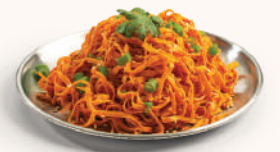
SIDE 1 COLD TOSSED TOFU SKIN 凉拌豆皮