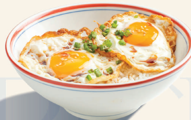
R1 MONTH END'S RICE 月尾的饭