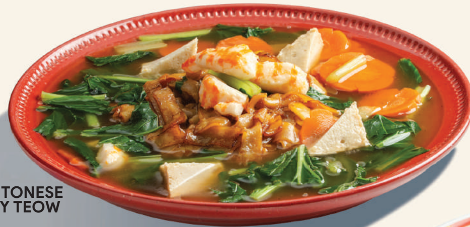
V3 VEGE CANTONESE FRIED KUEY TEOW 素滑蛋河粉