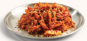
SIDE 2 SPICY PICKLED CABBAGE 东北辣白菜