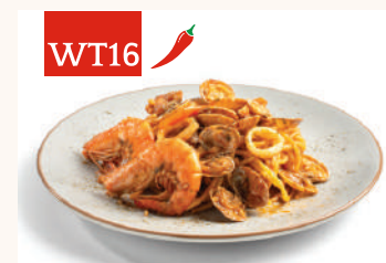
WT16 SPICY SEAFOOD TOMATO PESTO PASTA 辣味海鲜番茄青酱意面