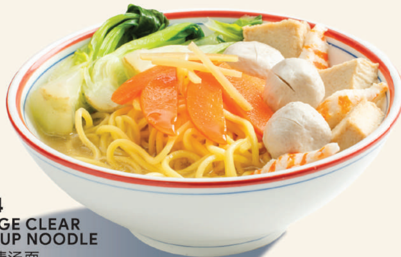
V4 VEGE CLEAR SOUP NOODLE 素清汤面