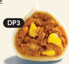
DP3 Chicken & Corn Pan-Fried Dumpling 鸡肉玉米煎饺子