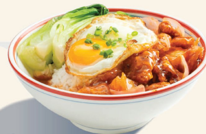
R4 SWEET & SOUR BOWL 酸甜丼饭