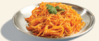
SIDE 3 Cold Tossed Shredded Potato 凉拌土豆丝