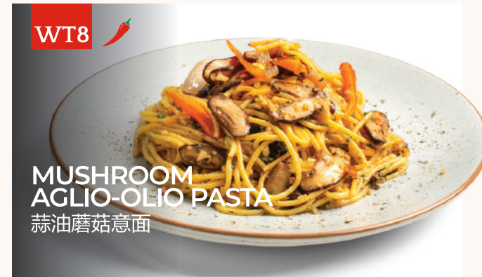
WT8 MUSHROOM AGLIO-OLIO PASTA 蒜油蘑菇意面