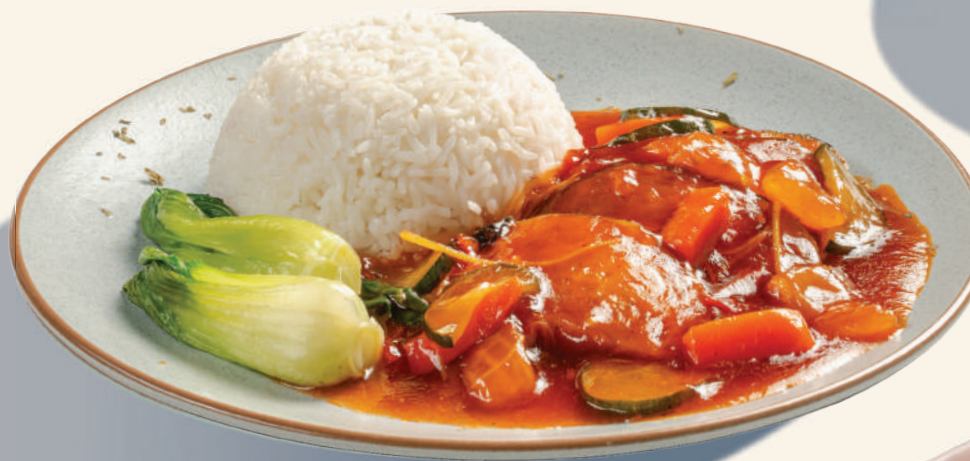
V7 VEGE SWEET & SOUR RICE 酸甜素饭 A Vege Chicken 素鸡 B Vege Fish 素鱼