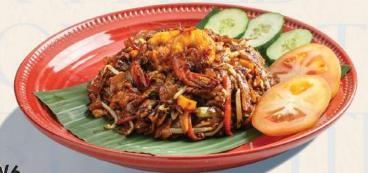
W6 FRIED KUEY TEOW 炒粿条