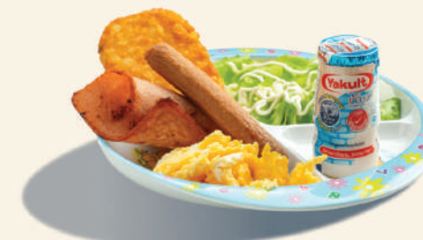
KID5 KID BREAKFAST PLATE 儿童早餐拼盘