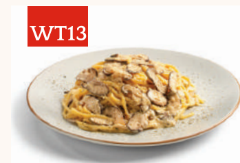
WT13 MUSHROOM CARBONARA PASTA 蘑菇奶油意面