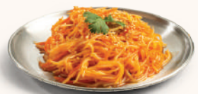
SIDE 3 COLD TOSSED SHREDDED POTATO 凉拌土豆丝