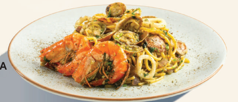
WT18 SEAFOOD PESTO PASTA 青酱海鲜意面