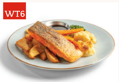
WT6 PAN-SEARED SALMON FILLET 香煎三文鱼排