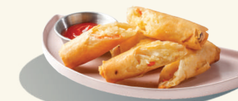
SN14 VEGETABLE SPRING ROLL(3PCS) 蔬菜春卷 (3个)