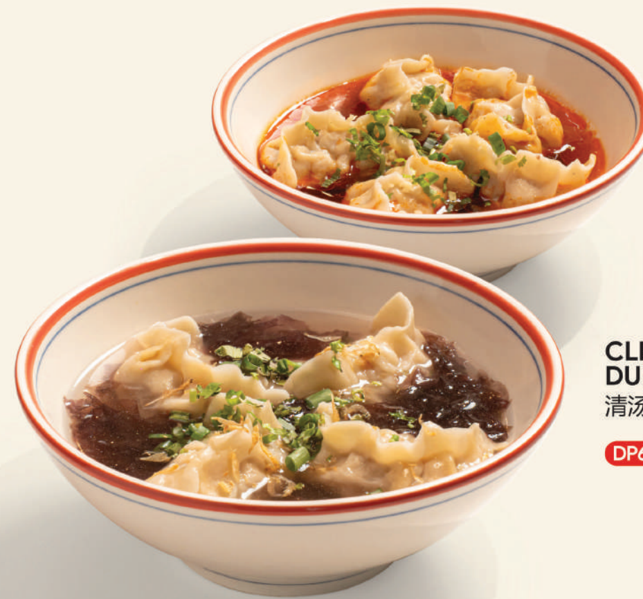
HOT & SOUR SOUP DUMPLING 酸辣汤饺子

YOU CAN'T GO WRONG WITH OUR CHEF'S HIGHLIGHTS HERE. CHECK OUT THESE DISHES WE'VE PROUDLY CRAFTED AND GET READY TO INDULGE IN OUR TIMELESS CLASSICS .