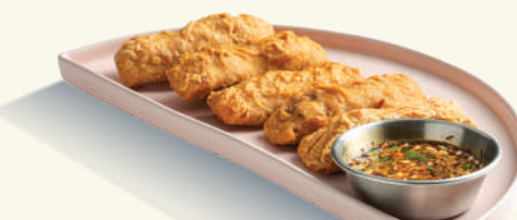
SN11 MINI FRIED BANANA(150g+-) 迷你炸香蕉 (150g+-)