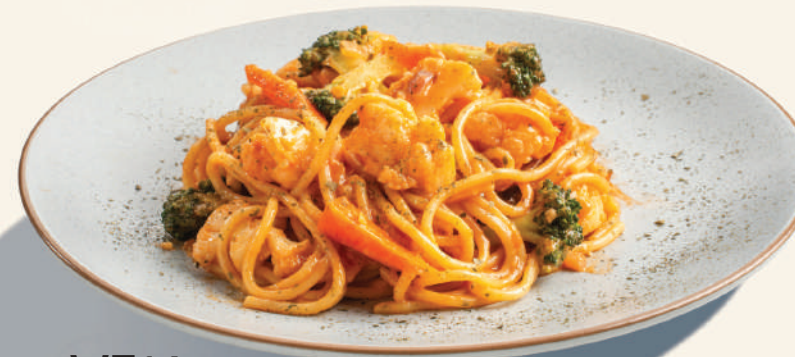
WT14 MIX VEGE TOMATO CREAMY PASTA 混合蔬菜番茄奶油意面