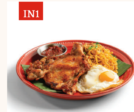
IN1 INDOMIE GRILLED CHICKEN CHOP