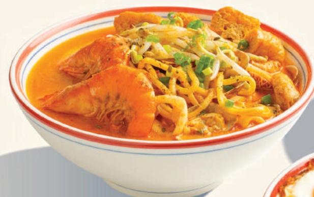
N2 SEAFOOD CURRY LAKSA 海鲜咖喱叻沙