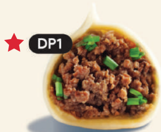
DP1 Beef & Chives Pan-Fried Dumpling 牛肉韭菜煎饺子