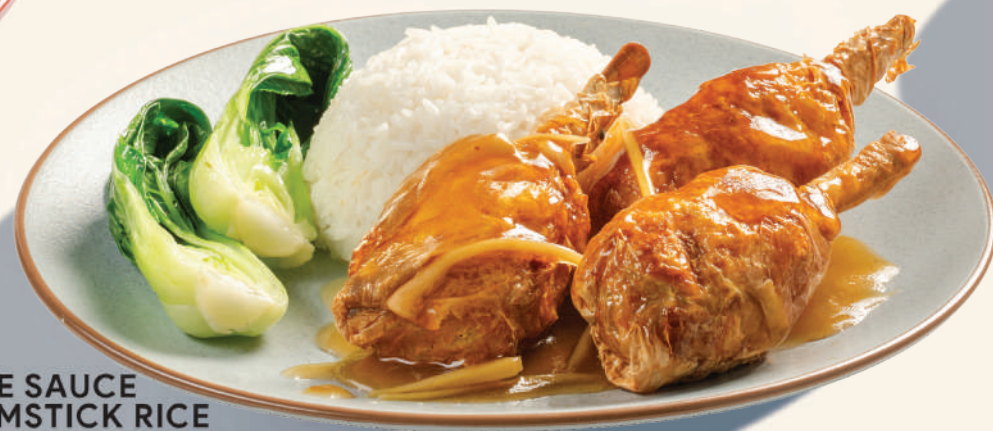
V6 VEGE SAUCE DRUMSTICK RICE 酱汁素鸡腿饭