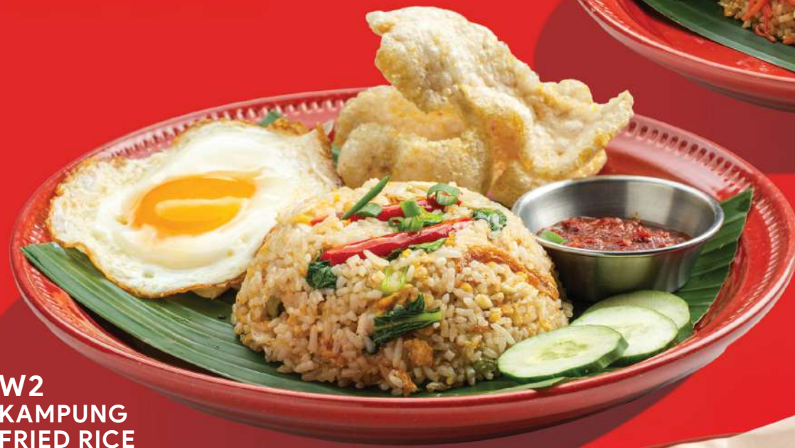
W2 KAMPUNG FRIED RICE 甘榜炒饭