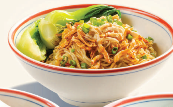
N7 SCALLION OIL NOODLES 葱油拌面

CAREFULLY SELECTED INGREDIENTS AND PRECISE COOKING TIMES ENSURE EVERY STRAND IS COOKED JUST RIGHT, ALLOWING FLAVORS TO CLING AND UNFOLD WITH EVERY BITE.