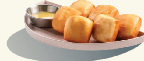
SN9 FRIED MINI MANTOU (6pcs) 炸迷你馒头 (6个)