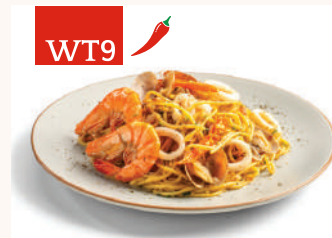
WT9 SEAFOOD AGLIO-OLIO PASTA 蒜油海鲜意面