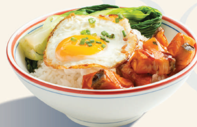
R7 SALMON RICE BOWL 三文鱼丼饭