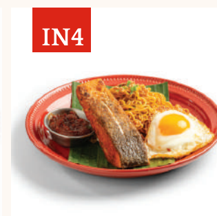
IN4 INDOMIE GRILLED SALMON