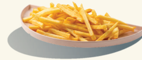
SN2 FRENCH FRIES 炸薯条

IMAGE SHOWN ARE FOR ILLUSTRATION PURPOSE ONLY