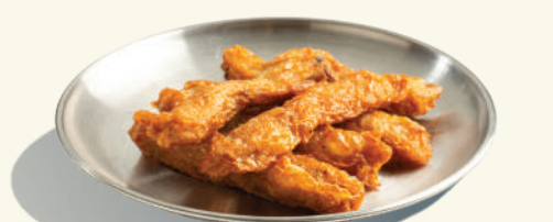
SN13 FRIED FISH ROLL(6PCS) 炸鱼条 (6个)