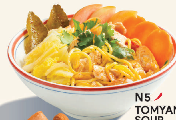
N5 TOMYAM CHICKEN SOUP 鸡肉东炎汤