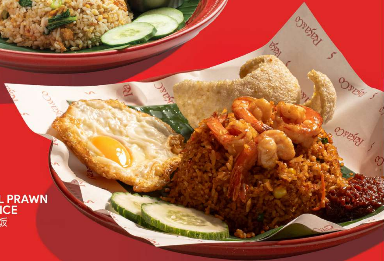
W3 SAMBAL PRAWN FRIED RICE 叁巴虾炒饭