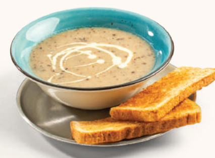
WT19 MUSHROOM SOUP 蘑菇汤