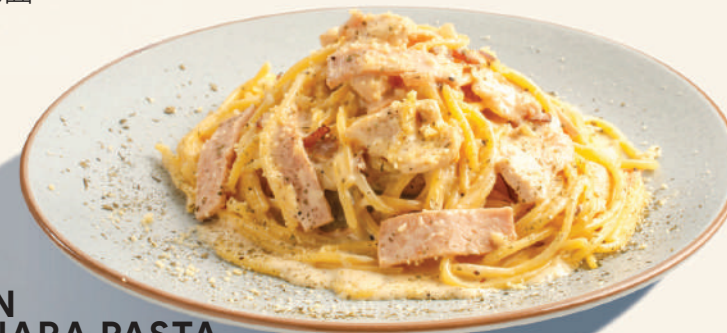
WT12 CHICKEN CARBONARA PASTA 鸡肉奶油意面