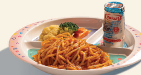
KID2 TOMATO PASTA WITH YALKULT 儿童番茄意面

A) Chicken Frankfurter 鸡肉香肠 B) Fish Fillet 炸鱼柳