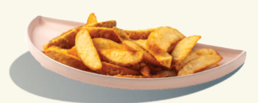
SN4 POTATO WEDGES 炸薯块