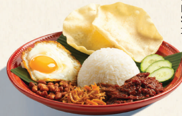
NL1 NASI LEMAK SUNNY SIDE UP EGG 太阳蛋椰浆饭