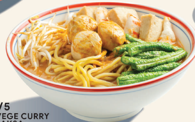
V5 VEGE CURRY LAKSA 素咖喱叻沙