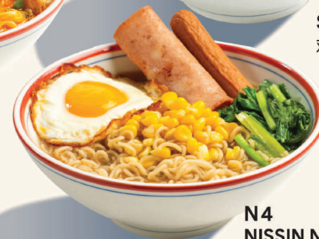
N4 NISSIN NOODLE (SESAME OIL CHICKEN) 香油鸡汤味出前一丁