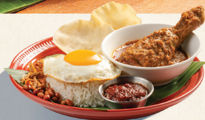
NL4 🌶️ NASI LEMAK CURRY CHICKEN 咖喱鸡椰浆饭