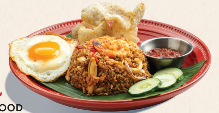
W4 SEAFOOD TOMYAM FRIED RICE 海鲜东炎炒饭