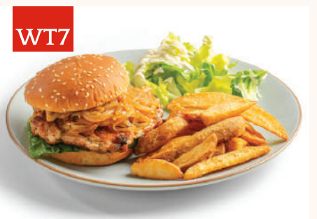
WT7 CHICKEN & CHEESE SCALLION BURGER 鸡肉芝士葱汉堡