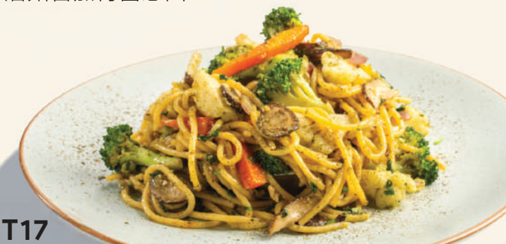
WT17 MIX VEGE PESTO PASTA 混合蔬菜青酱意面