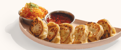
PAN FRIED DUMPLING 煎饺子