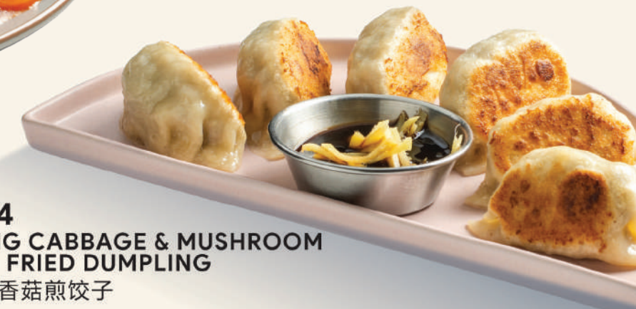
DP4 LONG CABBAGE & MUSHROOM PAN FRIED DUMPLING 白菜香菇煎饺子